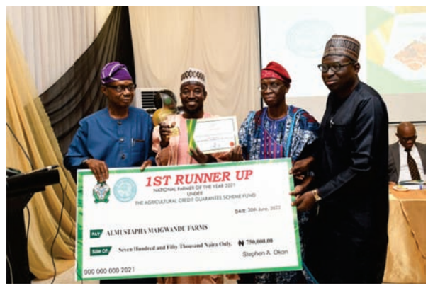
Winners of the Agricultural Credit Guarantee Scheme Fund (ACGSF) 2021 Best Farmers Award

he Central Bank of Nigeria (CBN) has restated its commitment in supporting hard work, innovation, and productivity in the agricultural value chain of the country, in a bid to boost economic growth and development.